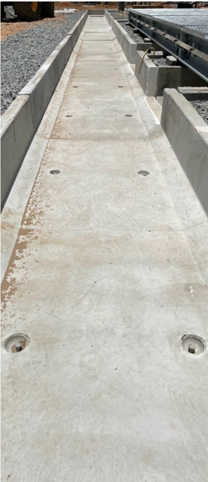
CONCRETE CABLE DUCT