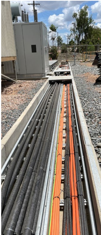
CABLE MANAGEMENT & SEGREGATION SYSTEMS