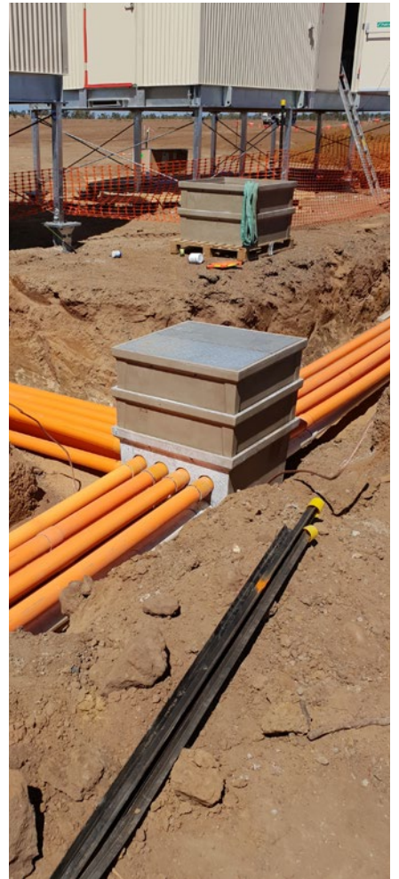
CONDUITS & PITS