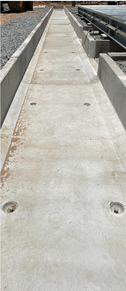
CONCRETE CABLE DUCT