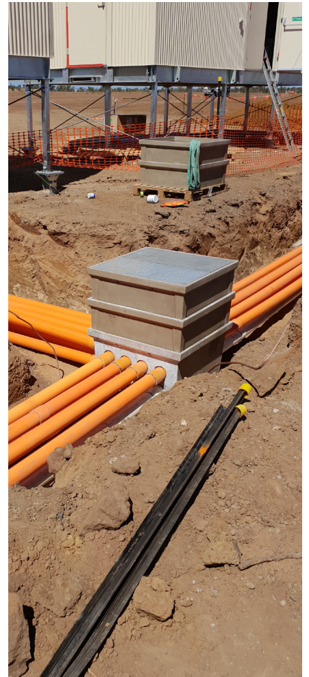
CONDUITS & PITS