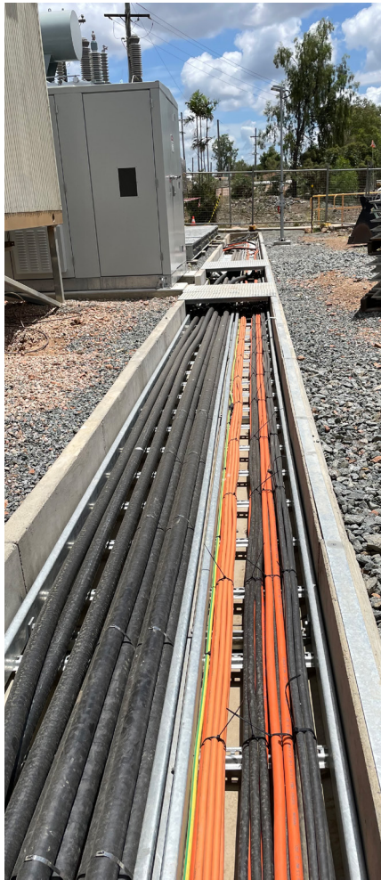
CABLE MANAGEMENT & SEGREGATION SYSTEMS